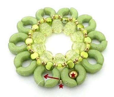
7) Insert 1 RB4, then a SB15 between the Arcos. Like this all the way around