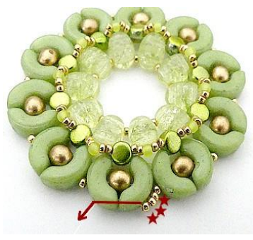
9) Insert 3 SB15 through the Arcos