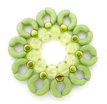
4) Here is the result Exit through the Kalos HERE (hole near the Samos)