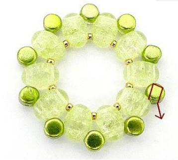
2) Pick up 1 Kalos between each Samos. Like this all the way around. Exit through the second hole of the Kalos