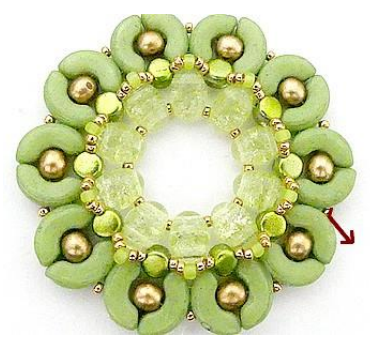
8) Here is the result Exit HERE through the SB15