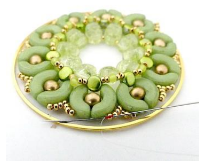
13) Pass over the circle and exit HERE through the SB15