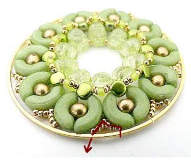
15) Pass over the circle and enter all SB15. Repeat steps 12 to 15 for the entire round