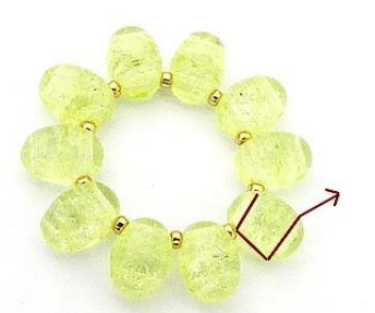
1) Alternately placing 10 Samos and 10 SB15. Close in a circle and exit from the second hole of the Samos