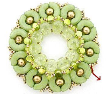
11) Here is the result Exit HERE through the three SB15