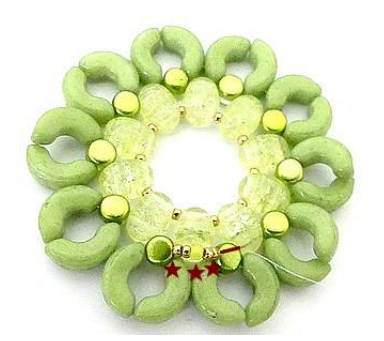
5) Insert 2 SB15, 1 SB11, 2 SB15 between each Kalos. Like this all the way around