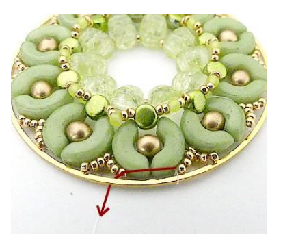
14) Go to exit HERE from the first SB15 and pass the thread under the circle