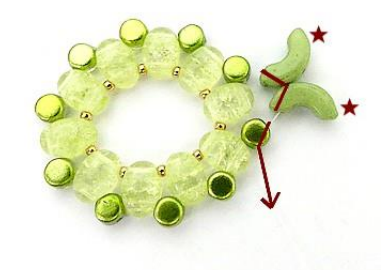
Place 2 Arcos between the Kalos. Like this all the way around