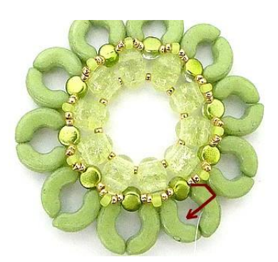
6) Here is the result Exit from the central hole of the Arcos