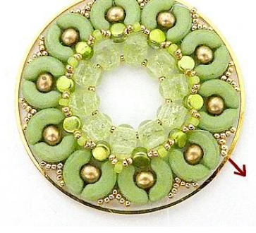
12) Place the circle