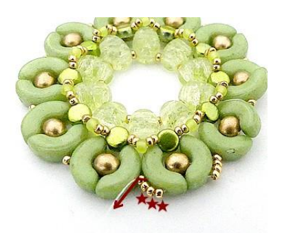
10) Pick up 3 SB15 through the SB15 HERE. Repeat steps 9 and 10 for the entire round